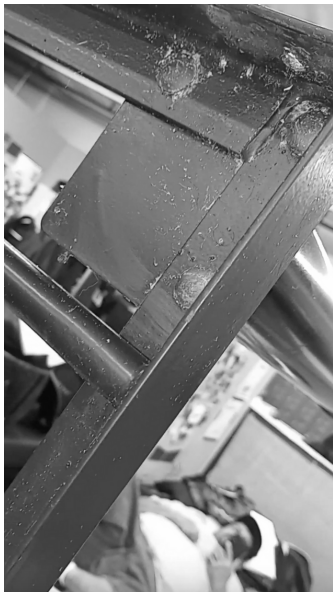
Photos: Evidence of the bedbug infestation at the PATH shelter in Placentia

What about the shelters that do exist? They are not just partial “solutions” but part of the problem. Often run by nonprofits and private entities which pimp off the suffering of the people, these sites crowd people together, surveil and stifle them, even in the least abysmal of conditions. Restrictions on visitors, when you can exit and enter, whether you can bring pets or even your belongings inside present people with bitter choices. Shelters work with police and government authorities to conduct invasive searches and even arrests and violence within their walls. Arbitrary evictions and abuse from the staff await even the “lucky ones” who get in. In many shelters, bedbugs and other pests leech upon and carry diseases among the residents. In some cases, people choose to sleep on the streets rather than be subjected to atrocious conditions. This is not just a problem in one or two places. This is endemic - - it is happening across the country.