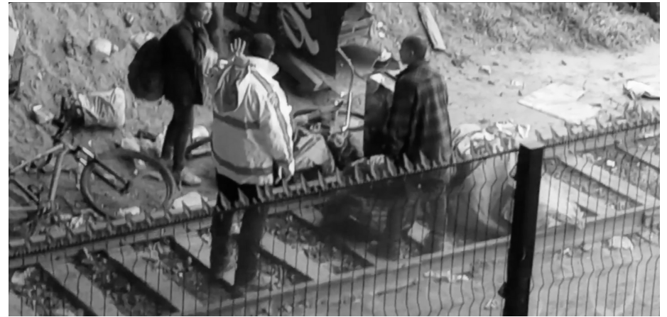
Photo: Sanitation and Police clear a homeless encampment in Placentia, CA. Sent from a resident of the encampment.

Developers and landlords make obscene amounts of money from renters, who every year give up more and more of their paychecks to these parasites. The COVID crisis led to some temporary relief in the form of eviction moratoriums, but these were largely ended after outcry from landlords and capitalists who demanded a return to “normal”.