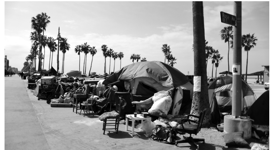
Tent city in Santa Monica, CA, 2021

On the streets and in the encampments, the conditions that homeless people are subjected to grow more desperate every day. The brutality of police raids, evictions, and roundups keep the homeless “out of sight and out of mind” instead of addressing any of the real problems people are facing. Vigilantes stalk the streets. Shelters provide only band-aid solutions, and are often sites of abuse. Nearly 600,000 people in the U.S. are homeless on any given night. More than 170,000 are in California alone. Between 2007 and 2022, the homeless population in California increased by 22%. From people “couch surfing” or sleeping in bank lobbies to living in large tent cities, how they end up in this position has everything to do with the workings of the system we are forced to live under.